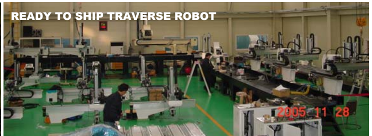
READY TO SHIP TRAVERSE ROBOT