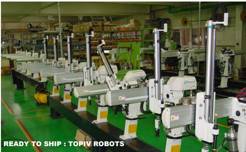
READY TO SHIP : TOPIV ROBOTS

# Cannot be used in conjunction with any other promotion, sales, discounts. Also HY have installed many traverse robots for large size molding machine up to 4000 tons IMM in North America.